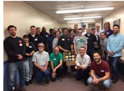
May 2017 Graduating Class

A Lean Leader understands to become a good teacher/leader, you first must be a great student. You must become a sponge looking to soak up and absorb new "Golden Nuggets" of wisdoms, techniques and experiences from others that you will be able to draw upon as you lead, teach and mentor others. Lean Leaders must appreciate there is always something you can learn, through networking and benchmarking.